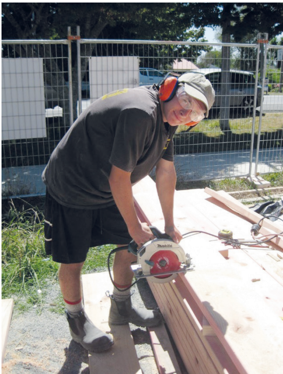
2019 BCATS photo competition's 'BCATS in the workplace' category winner enjoying his placement in Cambridge.

Because students will be physically active for each work placement day and face workplace hazards, all working through a BCITO Gateway programme must: