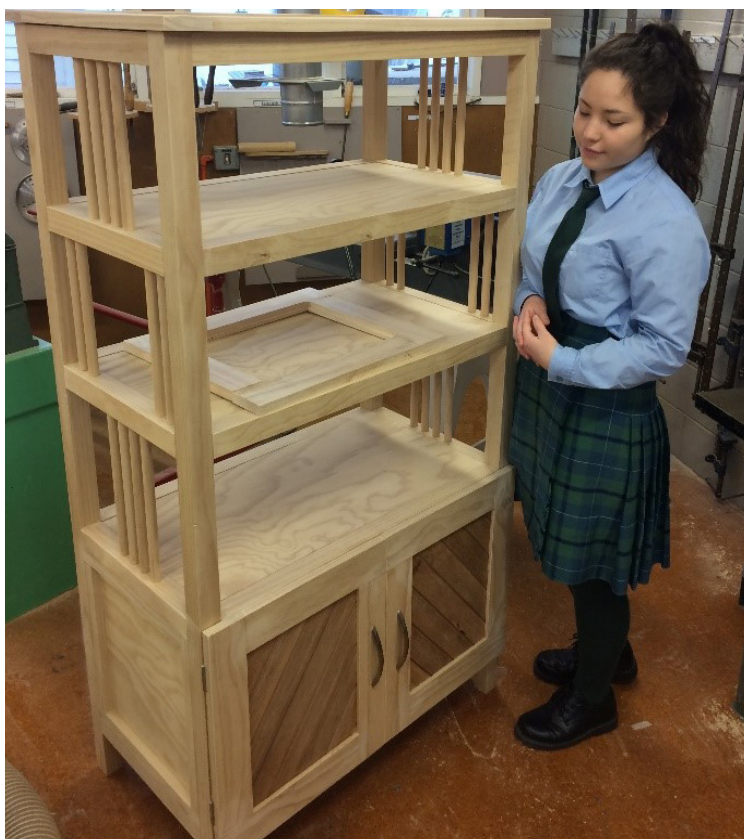
Storage cabinet before varnishing – Blue Mountain College.

The final project documentation must be sufficiently robust that it could be used by others to replicate the project to the stage at which it was completed.