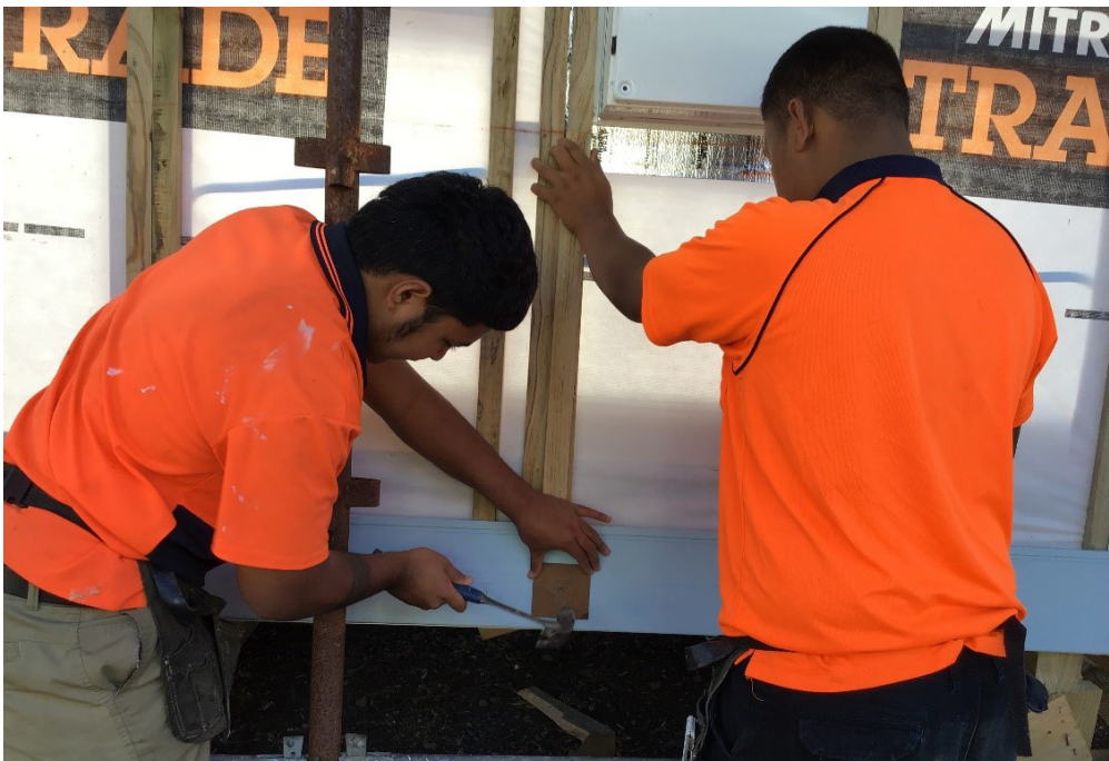
Students at Bay of Islands College constructing a house.