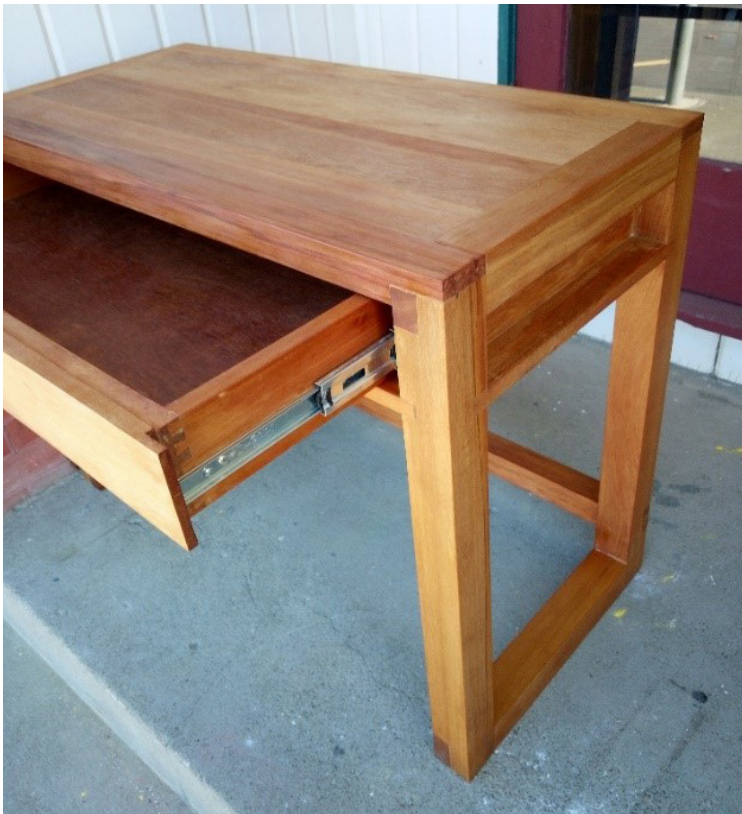
Quality joints and finish in this table with a hidden drawer, made with recycled rimu.

2019 BCATS Photo Competition winner of a 'Level 3 BCATS' award - Hagley Community College.