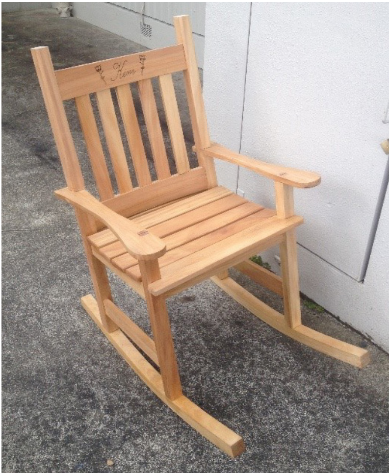
Rocking Chair – Rutherford College

Photographic and observational evidence must include proof that the projects' materials have been cut/measured/calculated/applied as required for the Stage 3 BCATS project.