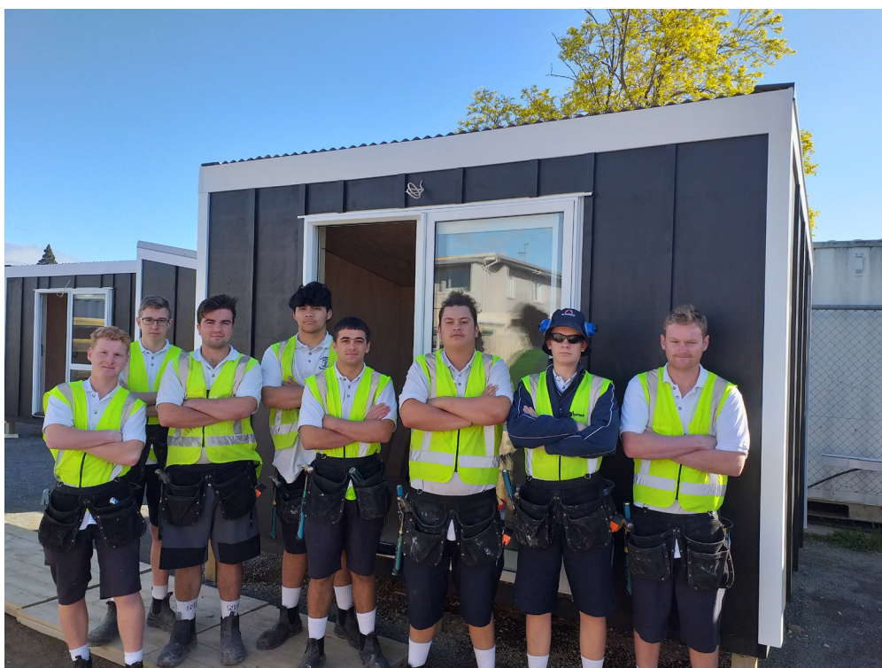
Four fully completed, insulated cabins ready for transport – Tauranga Boys College

(Note: an electrician did the electrical work.)