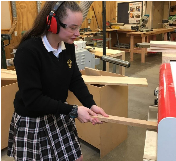
Using a thicknesser to ensure all seat planks are the same thickness.