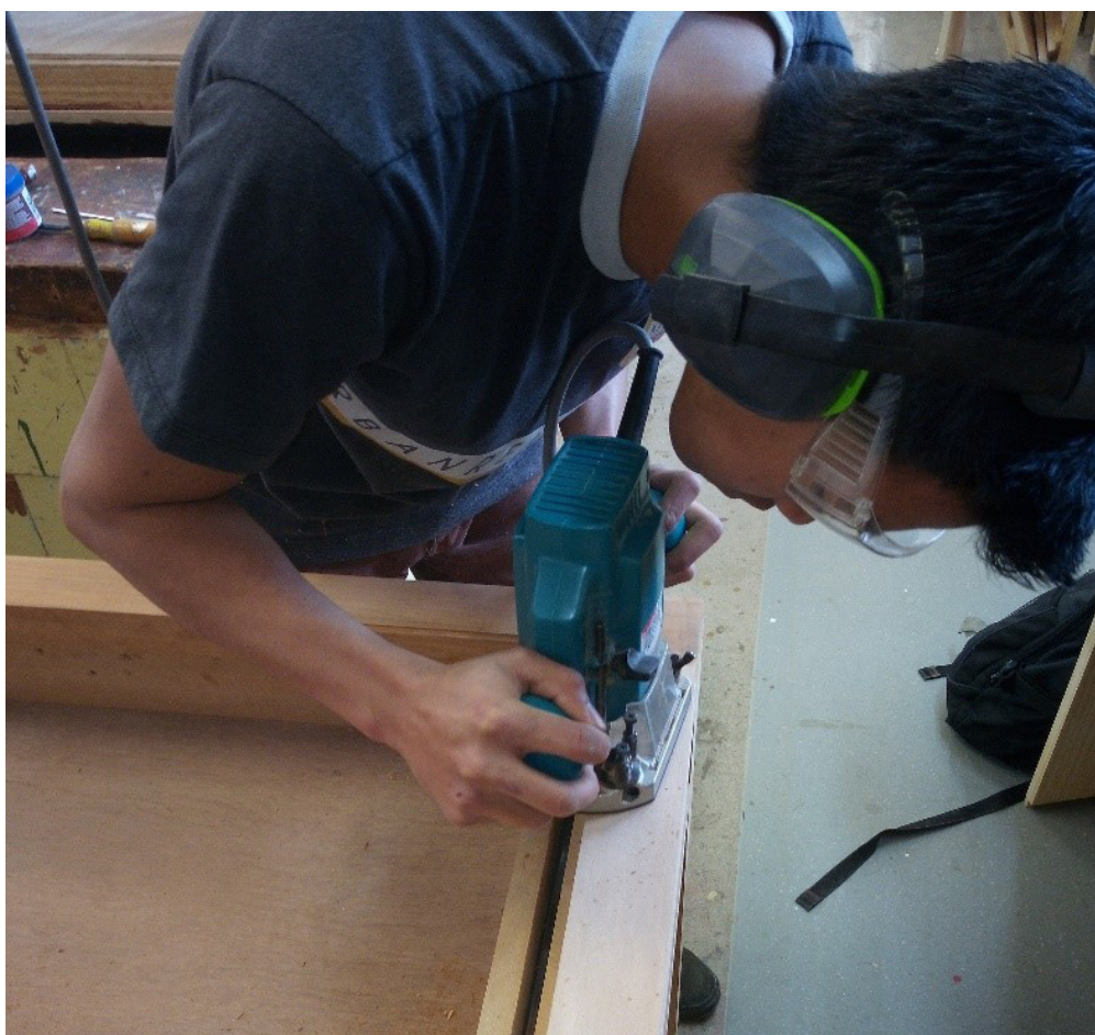
Hagley Community College.