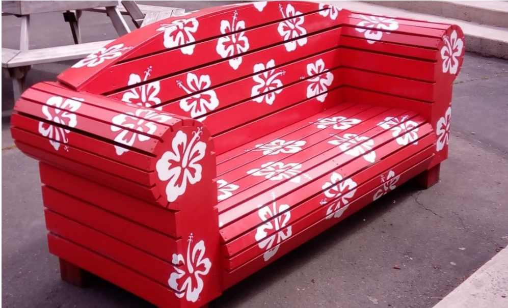
Painted wooden sofa (matching chair not shown) - Taieri College.