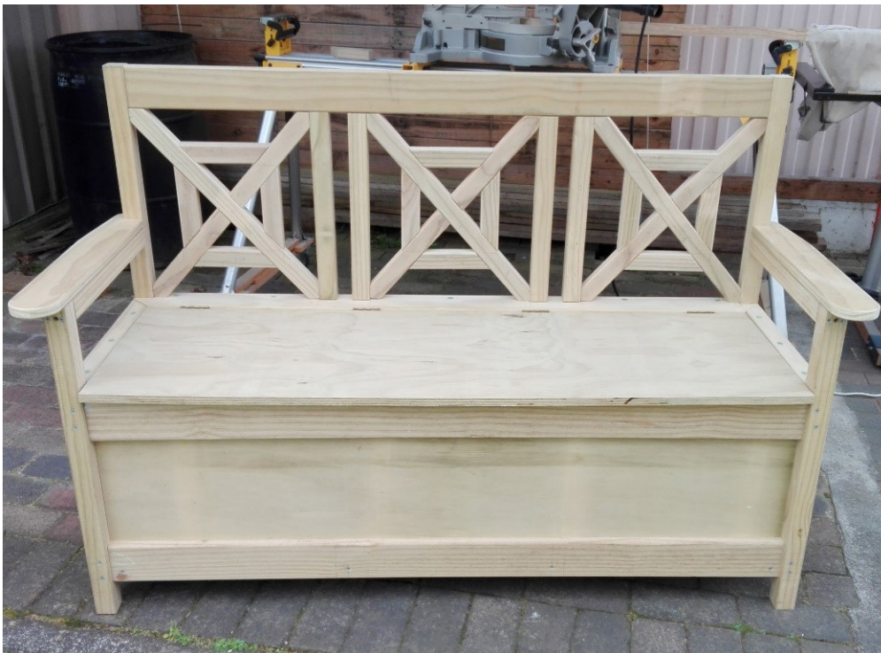
Bench seat with storage – Te Aho o Te Kura Pounamu (The Correspondence School).